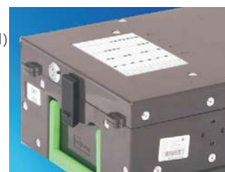
Design with high reliability