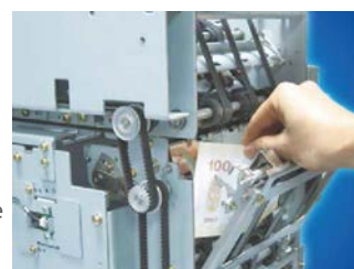
Easy solution of bill jams